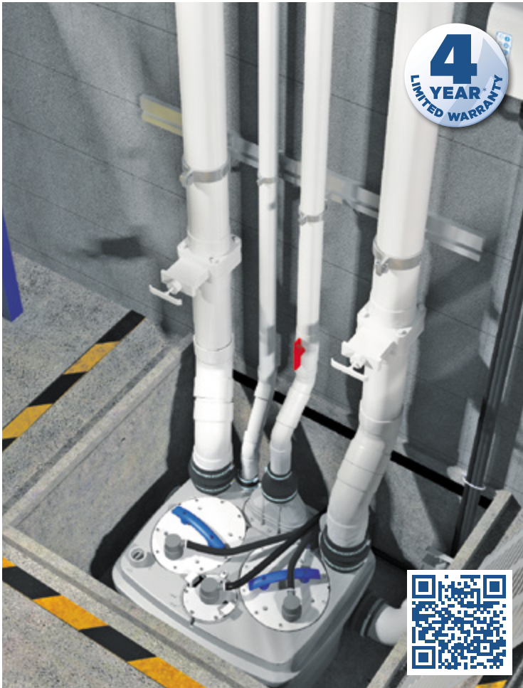
Installation below the ground