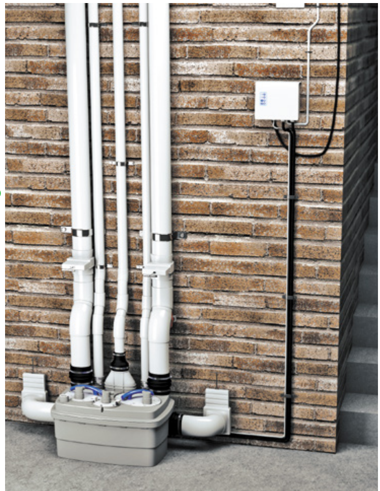
Installation above ground